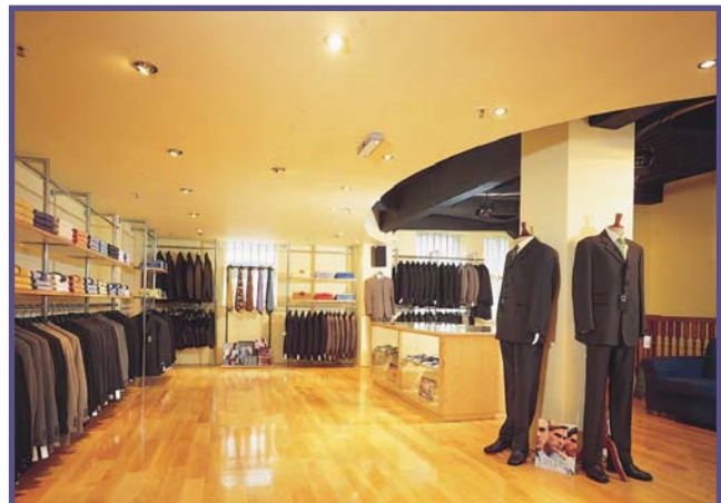
Comfort Cooling Applications